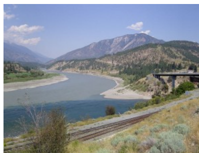
Lytton, British Columbia.