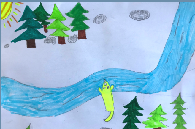
PIECE BY COVA PAYDLI (AGE 8)