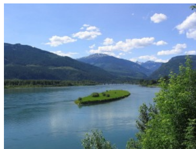
The Columbia River.